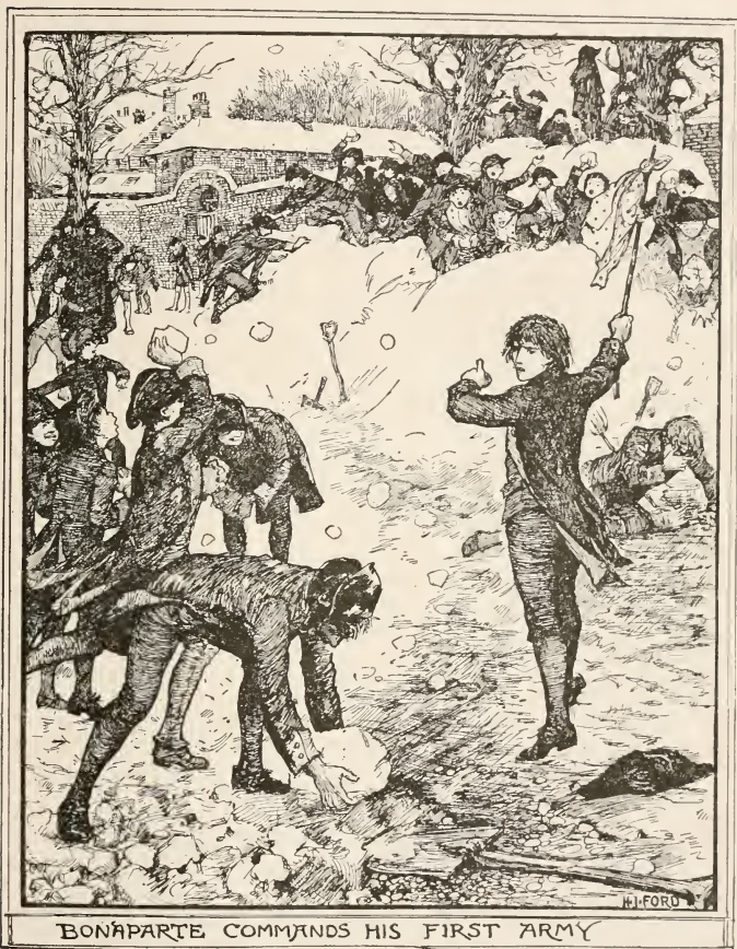
BONAPARTE COMMANDS HIS FIRST ARMY

It was wonderful, if anyone had cared to notice, what a change had taken place in the feelings of the boys